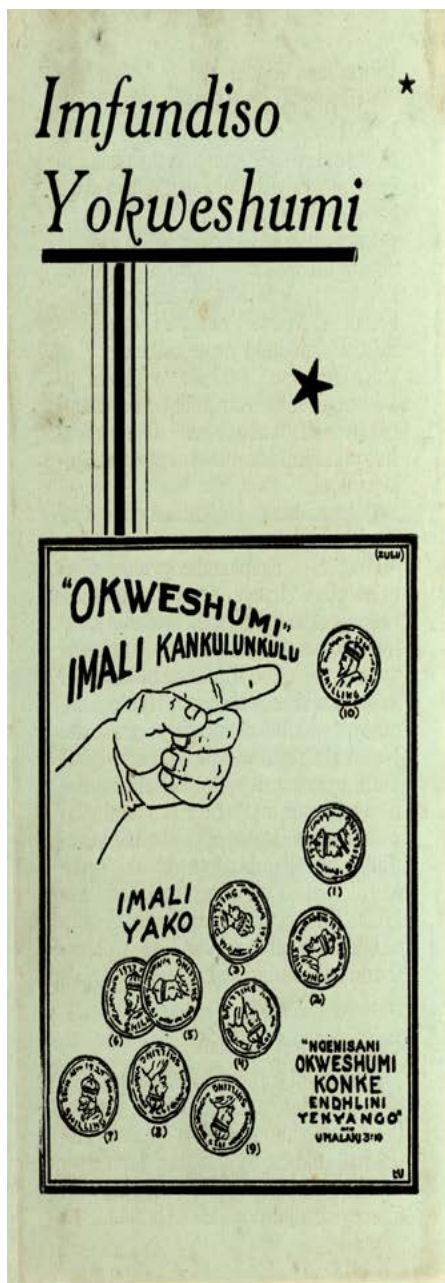
Pamphlet on Tithing in the Ndebele Language