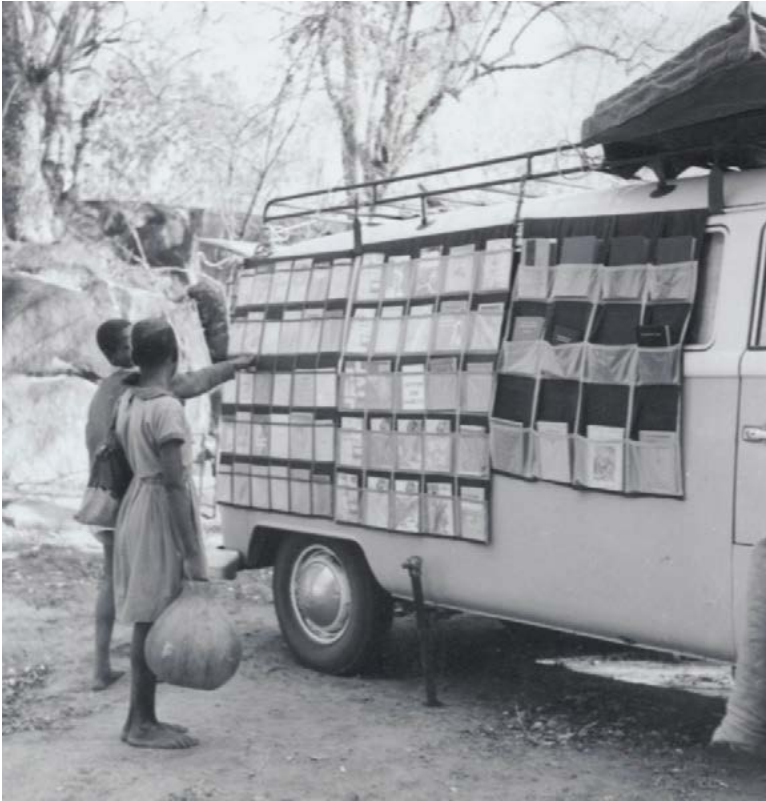
The Houser's van equipped with Bibles, books, and tracts for discipleship in remote Southern Rhodesia (1966).