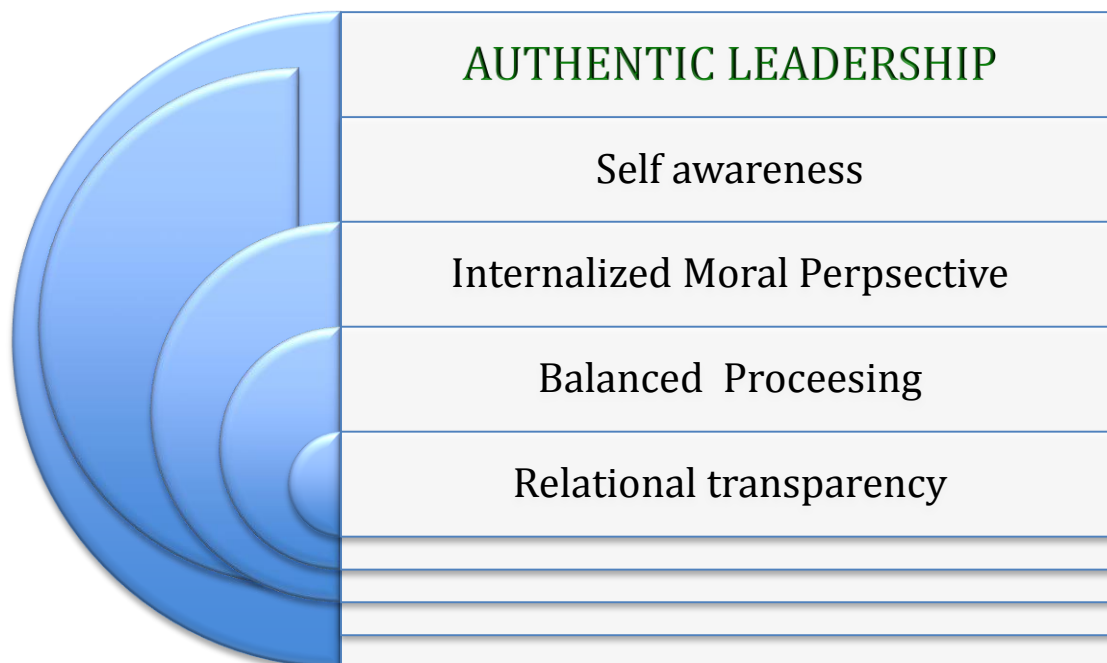
Figure 3.2. Authentic leadership.

The basic belief of this theory in any of its form is that leadership action is more effective when generated from the innermost character of the leader. Leadership in this context is not about just the actions but about the congruence between the basic values and attitude of the leader. Luther and Avolio define authentic leadership as “a process that combines the positive psychological abilities of leaders with functioning organization.” 190 For the study, I used the theory propounded by Wamlumbwa et al. I examined the basic components in the light of the practices that were suggested by the respondents for the purpose of leading an organization from corruption to fidelity. The first is self-awareness in which the leader is actively conscious of his or her individual