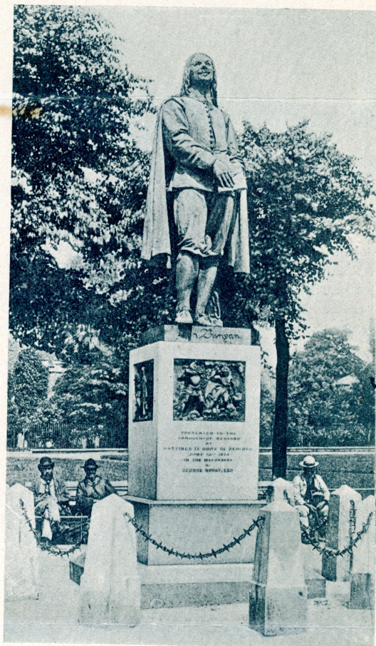
JOHN BUNYAN'S MONUMENT.

BLESSINGS IN BUNYAN'S TOWN. —During the past few months, since May, the Lord has been graciously working in Bedford. We have had the assistance of friends from America,